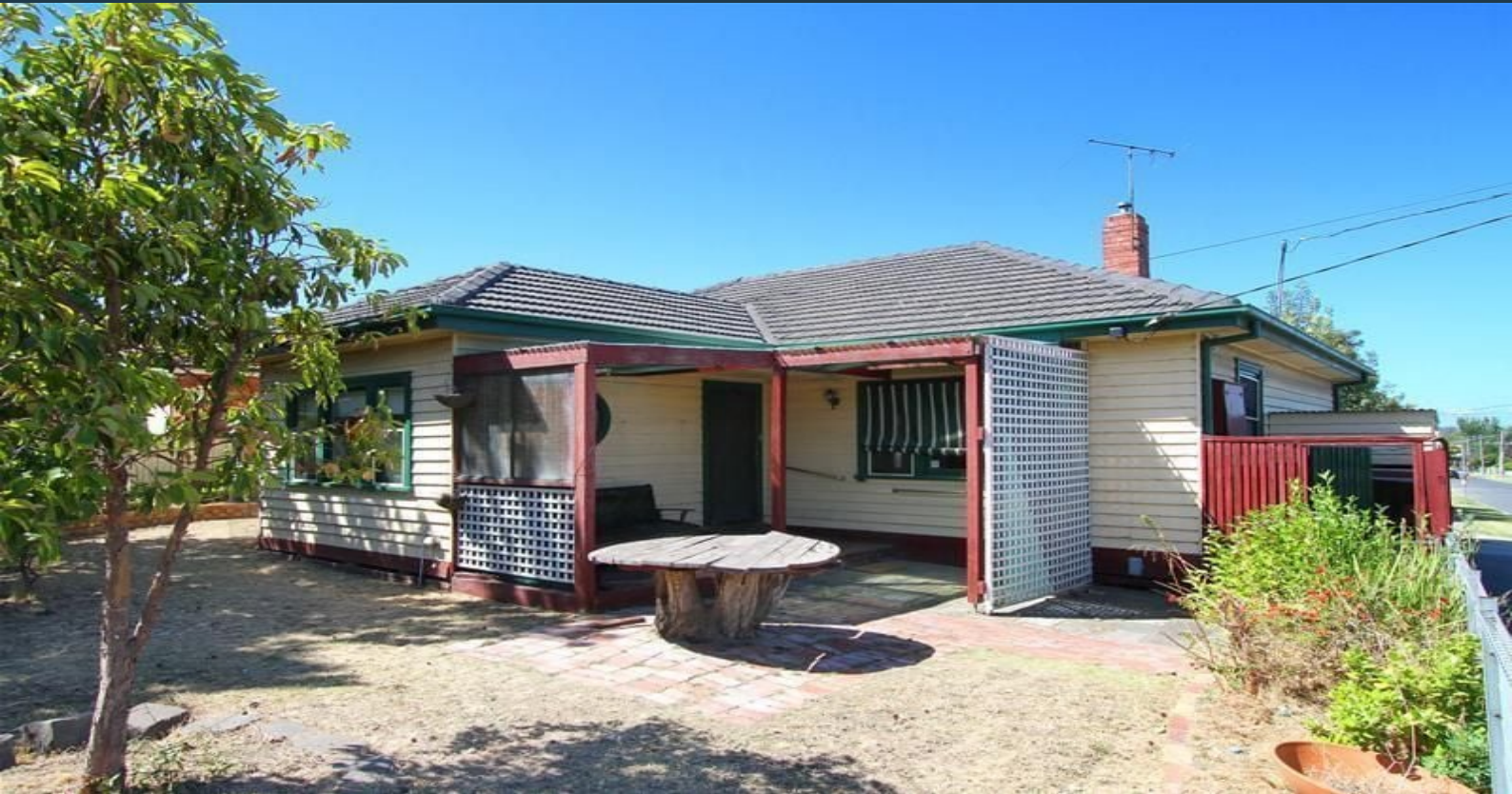
40 Bolderwood Pde. Reservoir