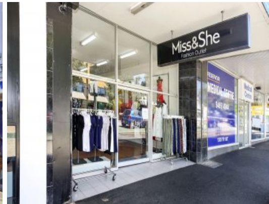
10 Edwardes Street Reservoir, VIC