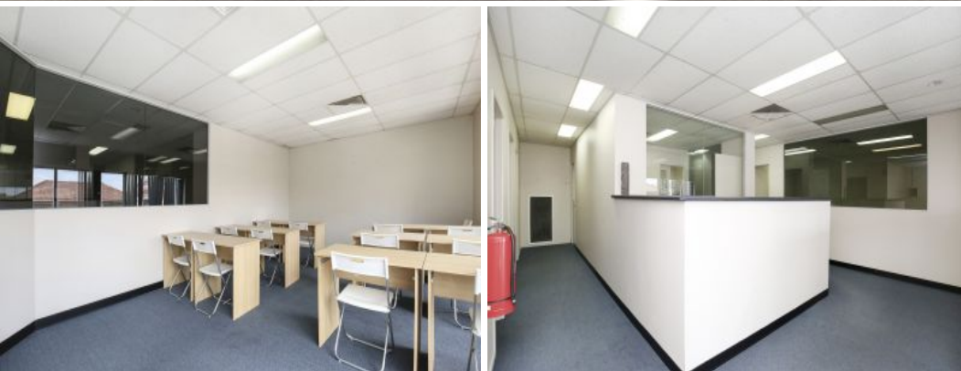
Level 1/24 High Street Preston, VIC