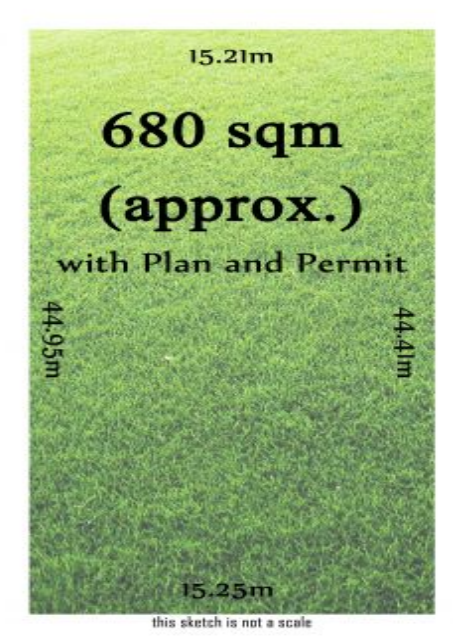
785 PLENTY RD RESERVOIR